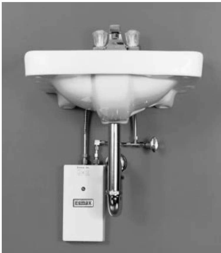
Designed to comply with .5 GPM handwashing code target outlet temperature 105° - 110°.

ADVANCED TECHNOLOGY • HIGHEST EFFICIENCY DESIGNED FOR DURABILITY