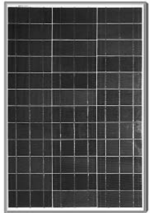
H580 / 50W - 55W

Robust construction and heavy duty anodized aluminium frame design makes this module suitable secure, simple and fast to be installed in many situations.